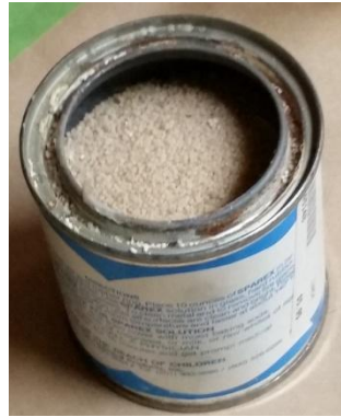
Figures 11 & 12 - Pickling Agent (powder mixed with water) - Vinegar works as well