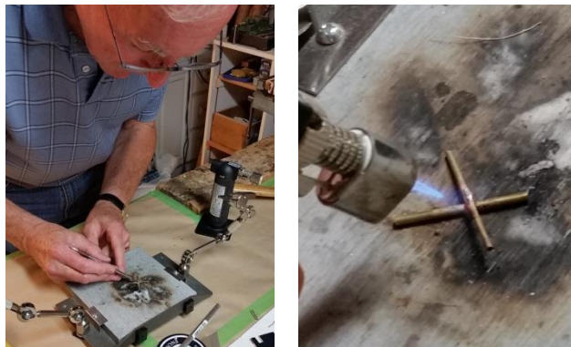
Figures 9 & 10 - Assembling and Heating