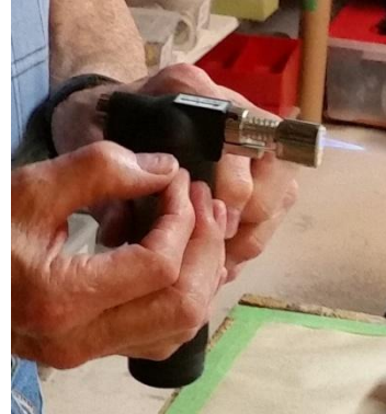
Figures 1 & 2 - Soldering Station and Butane Torch