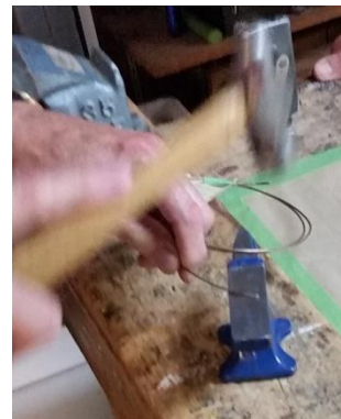
Figures 3 & 4 - Cleaning the Work and Hammering the Silver Solder Flat