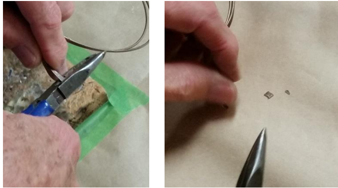
Figures 5 & 6 - Cutting Pieces of flattened Solder