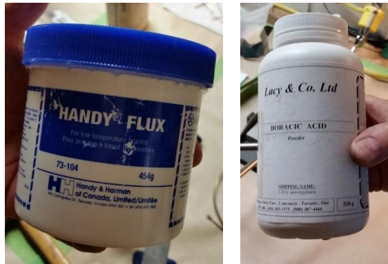
Figure 7 & 8 - Soldering Paste (Borax dissolved in water works just as well)